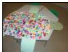
Art work from Bear class using collage

Thank you for your continued help and support it is greatly appreciated.