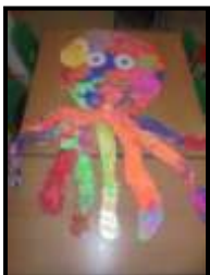
Art work from Owl class using paint.

Monday 23 rd Tuesday 24 th July - Training days